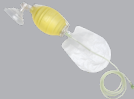
Bag Valve Mask (BVM) Resuscitator

Purchase a HeartSine Samaritan 350P during the month of March to receive a complimentary