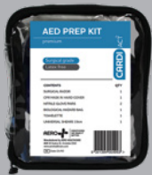
AED Prep Kit